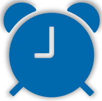
New Earlier and Later Service