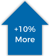
Increase in number of residents within reach of 30-minute or better service on weekdays

In a recent survey, we heard that riders and the general public wanted service earlier and later in the day seven days a week. The cost-neutral option would begin service earlier in the day and end it later in the day seven days a week on Route 108 Market Street and Route 205 Greenfield-Shipyard. Route 101 Princess Place would also begin operating 30 minutes earlier on Sundays.